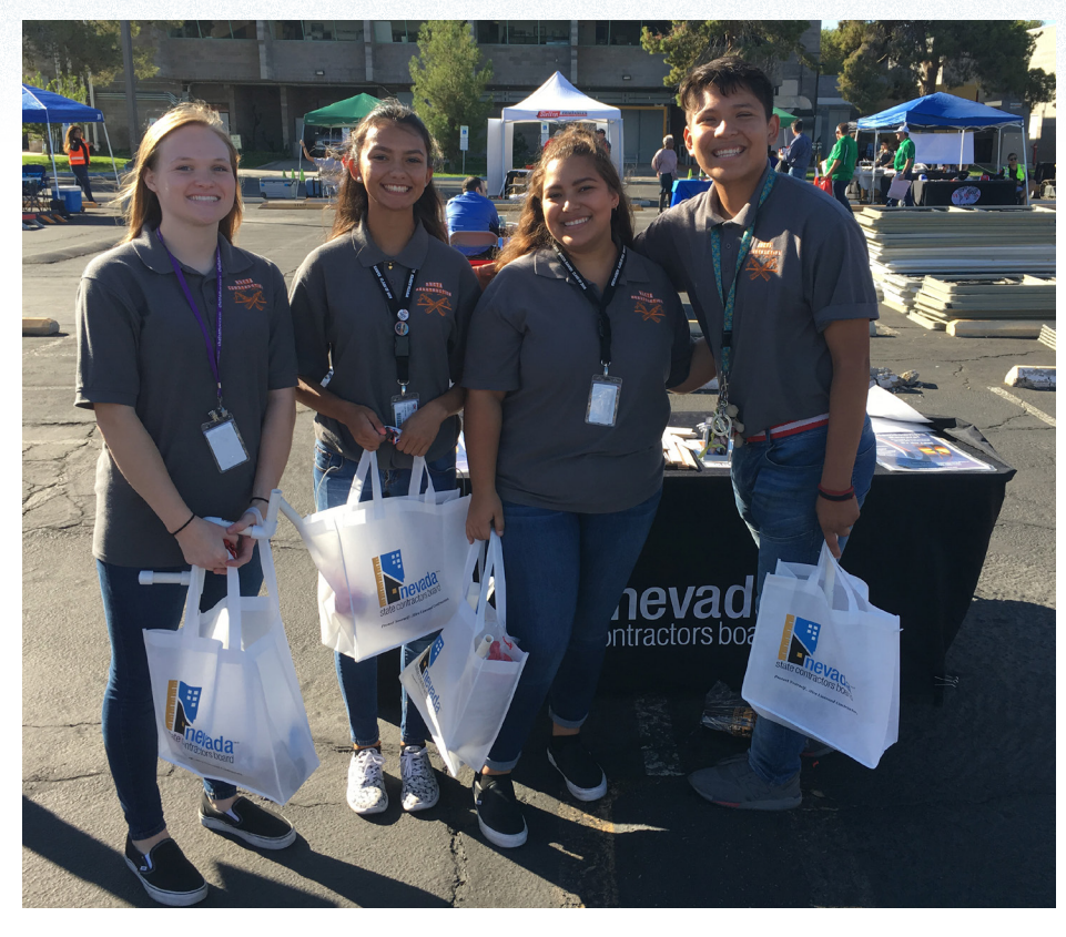
NSCB's Commission on Construction Education administers grants that help students and young professionals advance their training and careers in the industry. These students learned more about career paths and the Board's mission at a Construction Career Fair held, Oct. 5 at UNLV.

"The Contractors Board encourages construction professionals to not only contribute to the fund, but also to urge worthy organizations with whom they work to apply for grants," said NSCB